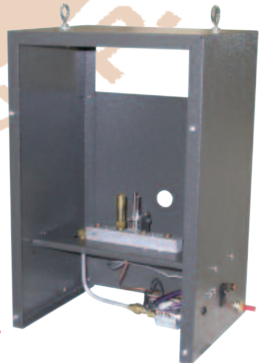
Pilot Burner Tube